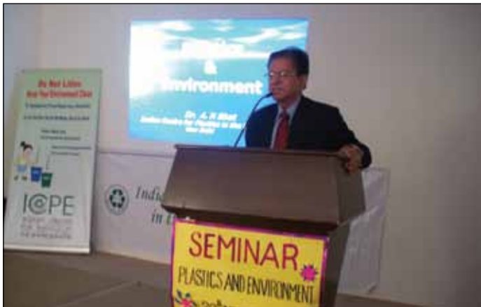
Shanti Gyan School

ICPE's awareness booklets, It's My World was also distributed to all students. The other booklets, Point-Counterpoint & Frequently Asked Questions & ICPE's recent editions of Eco Echoes/ENVIS Newsletter (10 copies) were handed over to Teachers for keeping in the school library.