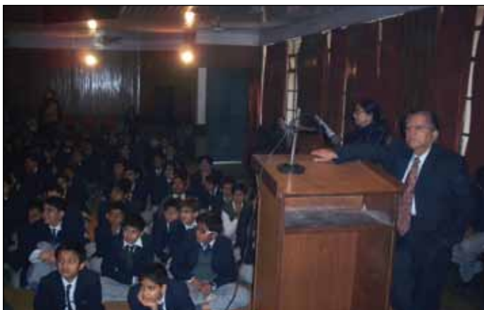
Ryan International & Apeejay School